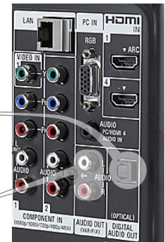
Typical TV Back-Panel Connectors