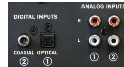
ZVOX Back Panel Connectors

If your TV has an optical digital output jack, use an optical digital (toslink) connecting cord to connect to the Optical digital input on the back of the ZVOX system.