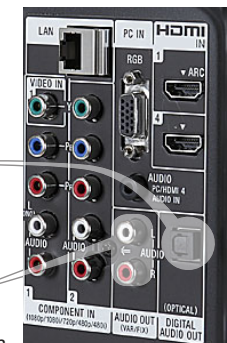
Typical TV Back-Panel Connectors