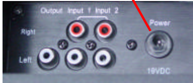
Rear input panel of 415